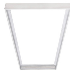
SURFACE MOUNT KIT LBSM24