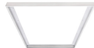
SURFACE MOUNT KIT LBSM22