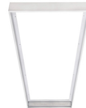
SURFACE MOUNT KIT LBSM14